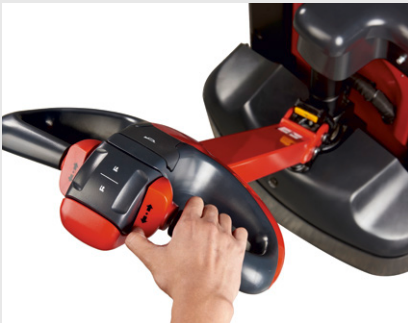
All controls ergonomically integrated in the Linde tiller head