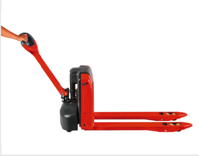
Long low mounted tiller ensures safety distance