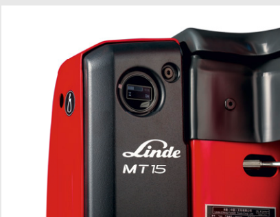
Intuitive multifunctional display