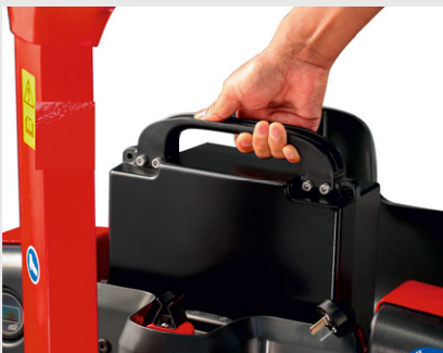
Easy plug and play Li-ION battery